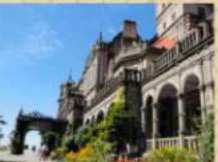
Viceregal Lodge Summer Hill, Shimla