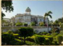
WH Balam Palace, Palanpur, Gujarat