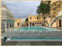
Taj Fateh Prakash Palac City Palace, Udaipur