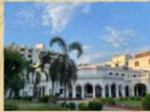
Taj Gorbandh Palace Hotel Taj Hotel, Jaisalmer