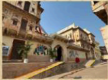
IHCL SeleQtions at Mandawa