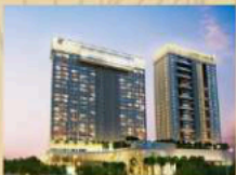
JW Marriott Kolkata